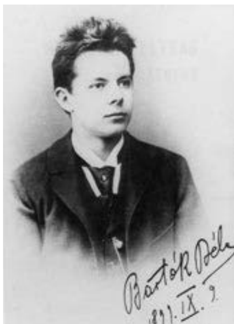
Béla Bartók in 1899, at the age of 18 years

The Hungarian composer Béla Bartók (BEY-lah BAR-tok) was 18 years old when he made a decision that would change the rest of his life. He had just completed his first serious musical studies at the gymnasium (high school) in Pozsony, Hungary (now Bratislava, Slovakia). There, he had met the Hungarian pianist and composer Ernő Dohnányi, only four years his senior. On Dohnányi's advice, Bartók chose not to attend the Vienna Conservatory—the most prestigious musical institution of that time, where he had been offered a scholarship—and instead to study at the Academy of Music in Budapest.