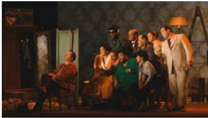
Canadian Opera Company, Gianni Schicchi

Pairing one-act operas to create a double bill can be tricky. Ideally, the underlying themes, the stage drama, and the music of each opera not only create a balanced evening but reveal more together than they would apart. Sometimes, the operas also intersect historically and offer unique insights into a particular era. Calgary Opera chose all of the above.