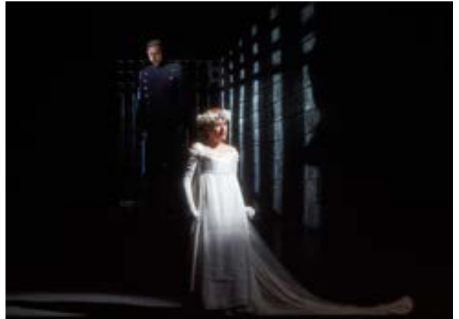
Canadian Opera Company, Bluebeard's Castle