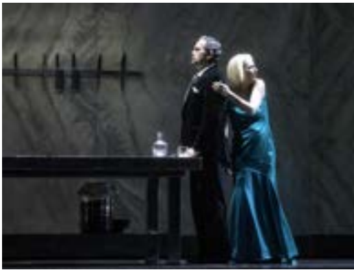
Metropolitan Opera, Bluebeard's Castle, 2019

In our latest double bill, Calgary Opera is thrilled to first present the dark and mysterious Hungarian drama Bluebeard's Castle , followed by a short intermission, and then the delightful Italian comedy Gianni Schicchi :