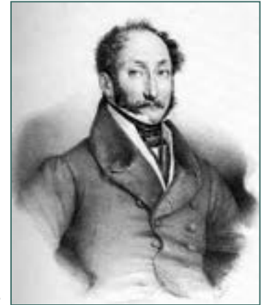
Felice Romani, photo public domain

Romani died in 1865 in Moneglia, in what is now known as Italy.