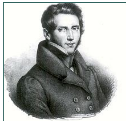
The young Donizetti

His next greatest success was Anna Bolena in 1830, which brought him fame across all of Europe and eventually across the Atlantic. Two years later he succeeded again with L'elisir d'amore ( The Elixir of Love ) with libretto by Felice Romani, the best theatre poet of the day.