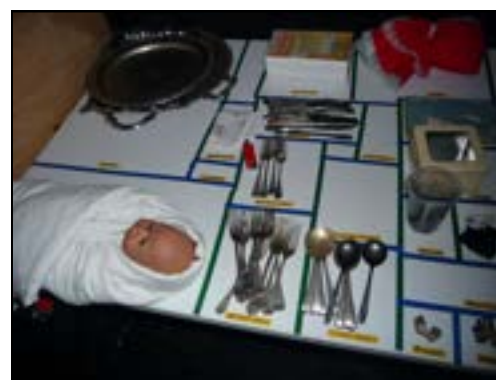
Example of a props table backstage. Every item is labelled and has its own place.

A Props Designer is responsible for the tables, chairs, lamps, swords, and other items that are used or carried by characters onstage in an opera, but which are not considered part of the set. The Props Designer must either make or obtain the props, keep track of them, and have them onstage at the right time. Props or Properties are divided into scene and hand props. A scene prop is an object that sits on the stage and is placed in one location; typically, a piece of furniture, like a lamp. A hand prop is an object that a performer carries on stage and uses in acting the part he is performing, such as a fan. Stage Hands and Prop Handlers put all the sets, furniture and props into place onstage. Set changes usually have to happen very quickly. It takes expert coordination to get everything done fast in the time available.