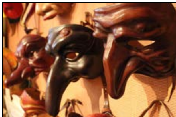
Typical papier maché commedia dell'arte masks from Venice, Italy

Many troupes were created and toured across Europe, contributing to the development of further art forms and famous characters and character-types like the harlequin and Pierrot of French mime, Punch from the English pair Punch and Judy and English pantomime, and many more. Much of the success of commedia dell'arte performances rested with the sensibility of the actor portraying the stock character and many actors of the time became famous for their portrayal of a particular character.