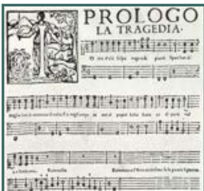
Image of Peri's score for Dafne, 1597

Opera developed as a result of discussions held in Florence in the 1570's by a group of artists known as the Camerata who were influenced by earlier Greek drama. Their discussions led to the musical setting of Rinuccini's drama, Dafne , by composer Jacopo Peri in 1597.