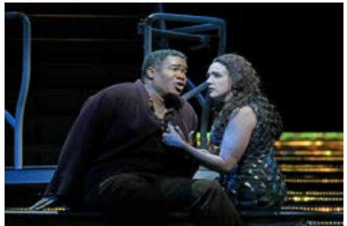
(L to R) Eric Owens & Susanna Phillips in Kaija Saariaho's L'amour de Loin at The Metropolitan Opera, New York (2016)

order to focus on their own stories while exploring and developing the vast body of the country's folk music and legends. Composers such as George Gershwin with Porgy and Bess , Douglas Moore with The Ballad of Baby Doe , Carlisle Floyd with Suzanna , John Adams with Nixon in China and Gian Carlo Menotti with The Medium , have all crafted operas that have been presented throughout the world to great success.