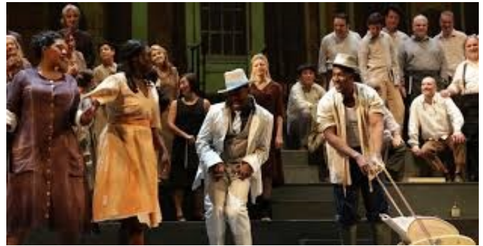
George Gershwin's Porgy and Bess at Teatro la Scala (2016)

German composers von Weber ( Der Freschutz ), Richard Strauss ( Ariadne auf Naxos ), and Wagner ( Der Ring des Nibelungen ) developed diverse forms, such as Singspiel and through-composed spectacles unified through the uses of leitmotif , a musical component that repeats itself throughout the opera. The English ballad opera , Spanish zarzuela and Viennese operetta helped to establish opera as a form of entertainment which continues to enjoy great popularity throughout the world.