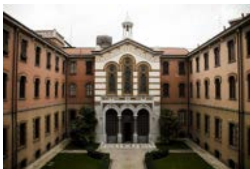
Above: Casa Verdi, Milan, Italy)

most profitable composer to stagnate in Sant'Agata for the rest of his days, Verdi's agent, Giulio Ricordi, convinced the prominent poet Arrigo Boito to write a libretto based on Shakespeare's Othello . Verdi couldn't resist the libretto which he considered far superior to any he had worked from before. Otello , the opera, came into existence when Verdi was 74 years old, and again, went on to great success.