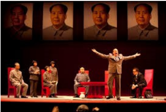
John Adam's Nixon in China , Vancouver Opera