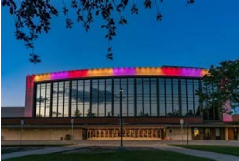
Welcome to the Southern Alberta Jubilee Auditorium